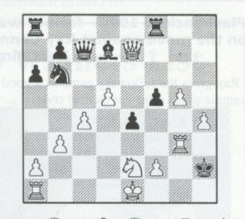
27 d6 響c5 28 公f4 響d4 29 區g2+ 雲h1 30 簋d1 豐b2 31 響e5 豐xa2 32 豐c3 e3 33 fxe3 豐xg2 34 公xg2 雲xg2 35 豐e5

豐g5+ 查f7 19 豐xh5+ 查f6 20 豐h7 拿d7 21 g4 e4 22 g5+ 查e5 23 豐xe7+ 查f4 24 ④e2+ 查f3 25 簋h3+ 查g2 26 簋g3+ 查h2